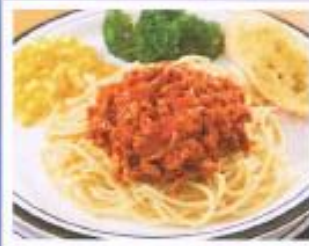
Spaghetti Bolognese (V) served with Garlic Bread & Seasonal Vegetables