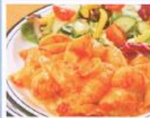
Pasta Dish of the Day Served with a Side Salad