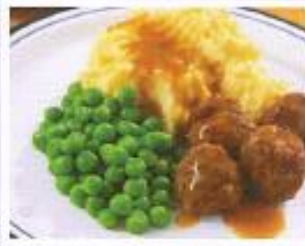
Meatballs served with Mashed Potato, Seasonal Vegetables & Gravy