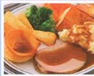
Roast of the Day served with Roast/Mashed Potatoes, Seasonal Vegetables & Gravy