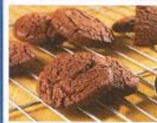
Chocolate Orange Cookie

Available every day - Unlimited Salad, Freshly Baked Bread, Fruit Yoghurt, Fresh Fruit Platter & Chilled Water. For allergen information, please ask one of our Catering Team. All the above dishes are subject to availability.